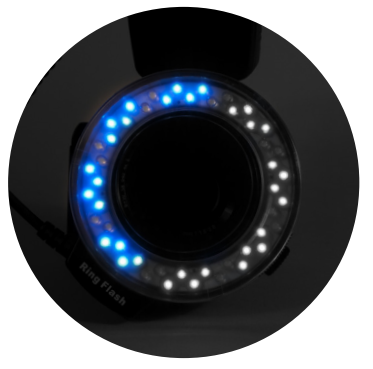
RIGHT HALF LIT