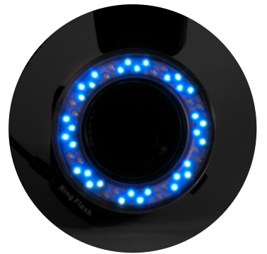
RING FLASHES AS PHOTO IS TAKEN